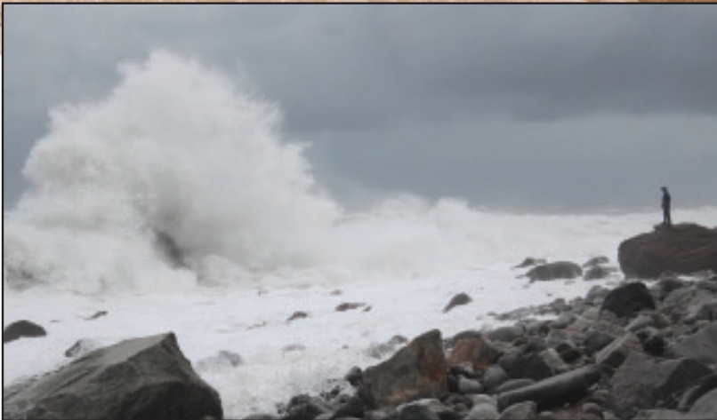
Surf near Malaspina Glacier, Alaska.