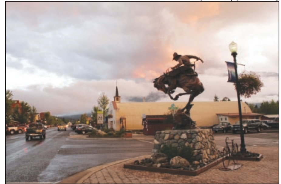
Joseph, Oregon, one of the gateways to Oregon's rugged Wallawas.

Plan. However, fifteen years later, the Screens are still in place. The agency has only half-heartedly complied with the Screens, and the previous administration attempted to do away with them completely.