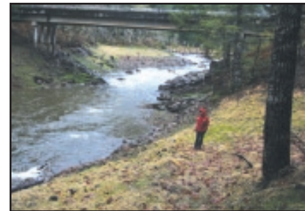
Trout Creek restored

conservation groups joined forces to remove the dam and restore over 20 miles of prime habitat for Columbia River Steelhead. The film provides a first hand look at how this successful restoration project was accomplished from start to finish. Other short films will also be shown. Tickets are $7 in advance from Crag, the Gifford Pinchot Task Force and the Hollywood Theater. Doors open at 6:30 pm, films start at 7:00.