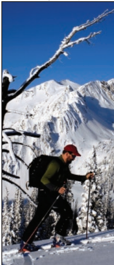
Skiing in the Wallawas.